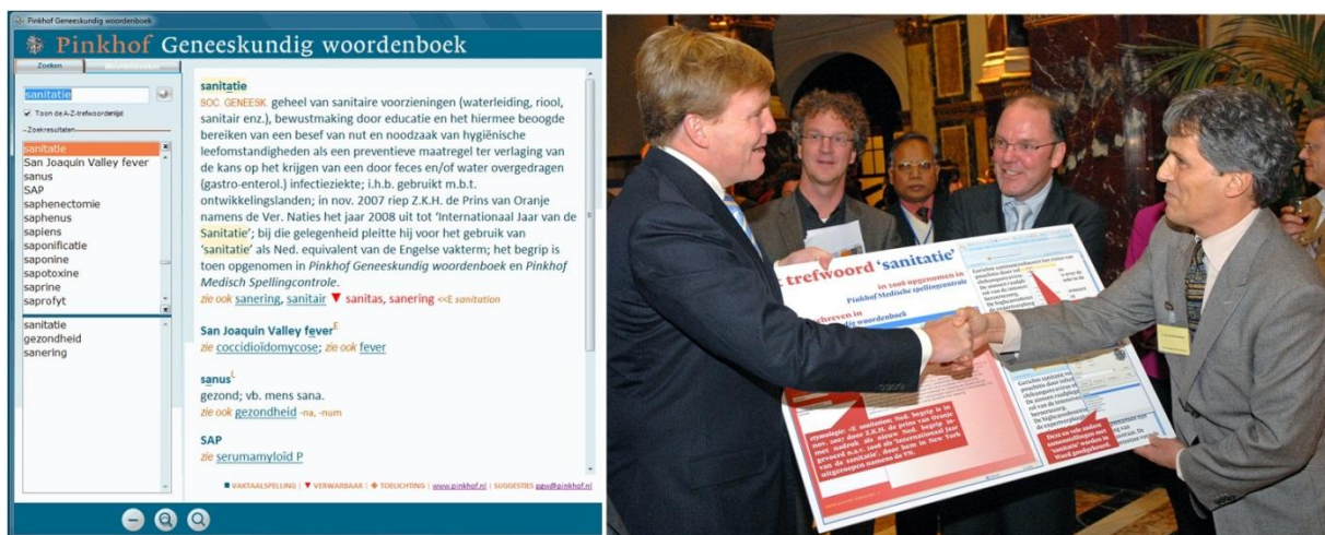
Figure 7. Introducing in 2008 my medical spellchecker to the Dutch crown prince, HRH Willem-Alexander van Oranje.

In 2008 the Dutch crown prince suggested including sanitatie in spellcheckers; his wish was my demand.