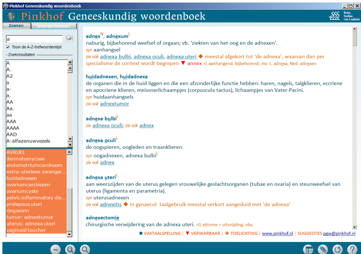
Figure 5. The Pinkhof PC edition showing the adnex entry.