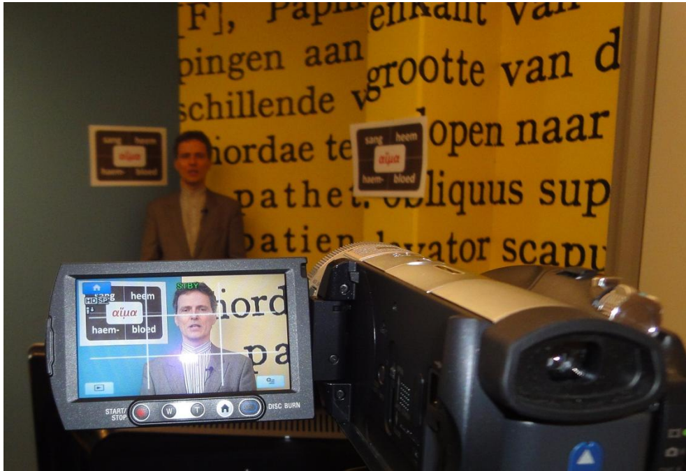
Figure 8. The author whilst video-hosting a medical dictate, notably in front of office wallpaper with enlarged text taken from the Pinkhof medical dictionary.

From 2012 onward, I will be writing and hosting a quiz on medical language for students from all Dutch medical universities participating in the annual Rosalind Franklin Contest. My multiple-choice questions will confront both candidates and the participating audience alike with orthographic and semantic pitfalls in medicine.