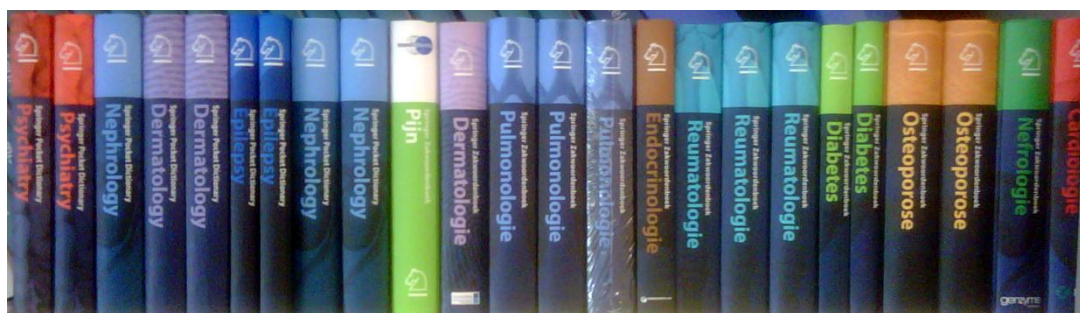
Figure 6. Pocket dictionaries extracted from the main Pinkhof dictionary.

Each database record has one up to six medical specialty codes, allowing for a quick selection. However, the coding is not unambiguous and requires multiple search rounds, as a term on rheumatoid arthritis may have been assigned 1 rheumatology 2 immunology 3 surgery or equally well 1 immunology 2 surgery 3 rheumatology .